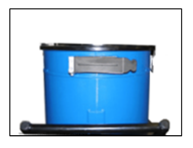
Auto filter cleaning