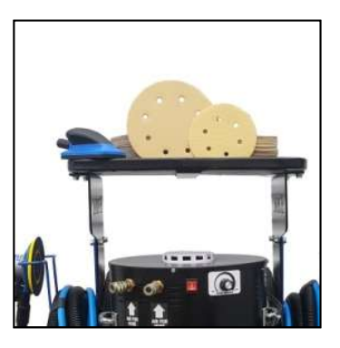
Top storage tray