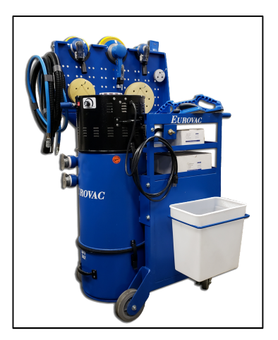
Accessory cart with lockable cabinet

The following are optional system upgrades that are available as an add-on to any of our portable units.