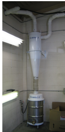
Cyclonic Wet Separator