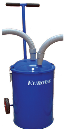
Portable Wet Separator