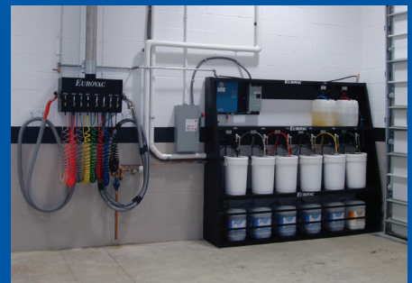
Central Chemical Dispensing System