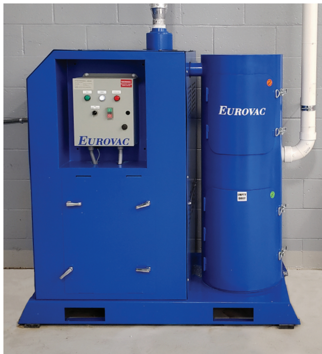
Eurovac I System