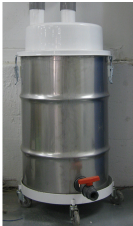
In-Line Wet Separator