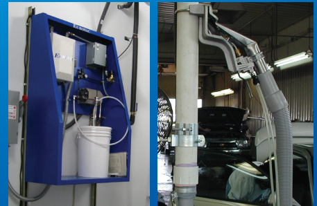
Central Hot Rug Shampoo Dispensing System