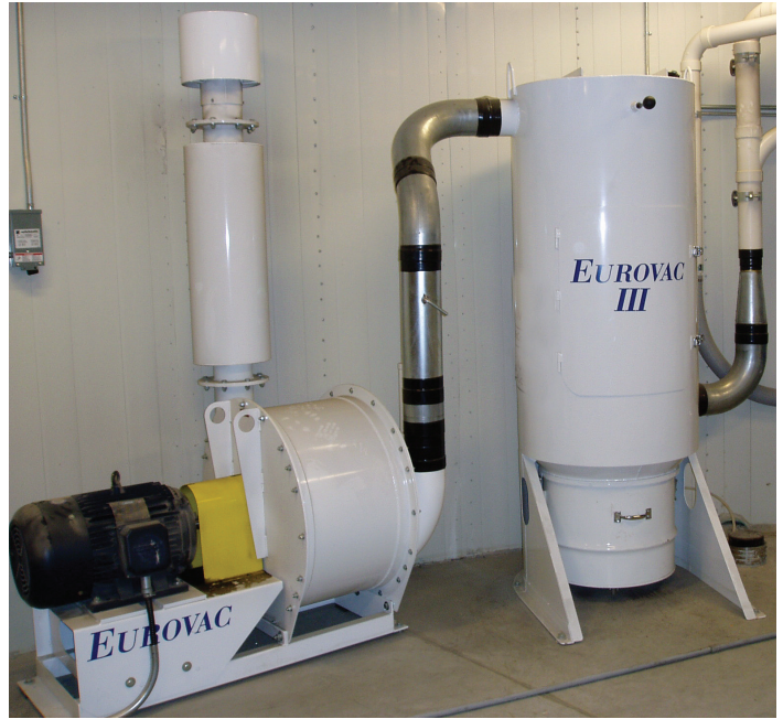
Eurovac III System