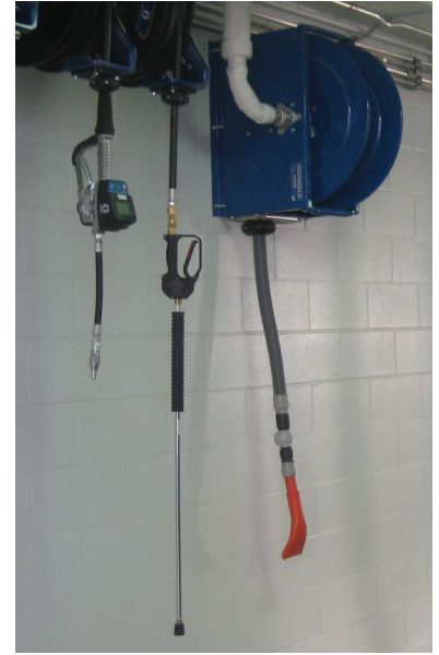
Spring Recoil Hose Reel (Wall or Roof Mount)